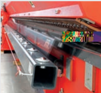
/ Supporting bar with rollers